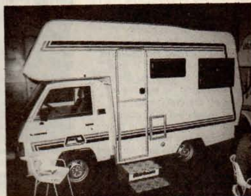
The Horizon Colt L300. Another threat to the VW, this little coachbuilt costs under £9,000.

With far fewer VW motor caravans than usual among the exhibits at the 1982 Caravan Camping Holiday Show, it was left to the new VW Santana GX5 to steal the melight for the Wolfsburg marquee.