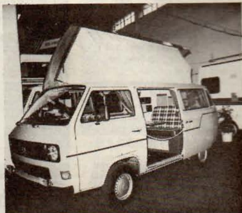
The VW Diamond shown by Travelworld and Diamond RV.