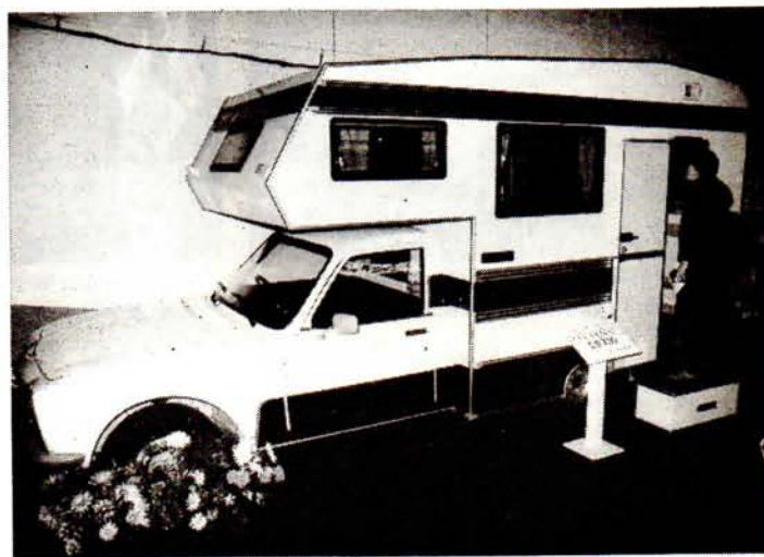
Auto-Trail's Cheyenne on the Peugeot Pick-up.

American-style space and specification with European quality and economy, the Miami on the Fiat Daily.