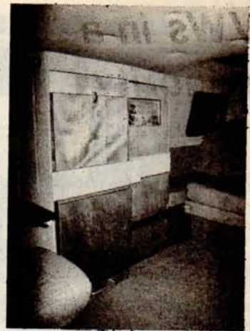
The ingeniously designed cabinet which houses the 'life support' equipment in the Murvi , here seen in the new Fiat Ducato -based model.

For those seeking great versatility in a motor caravan, the 'Murvi' (Multi-use Recreational Vehicle) is now also available on a Ducato . Fixed-roof conversions, the Murvis are based around the 'Incredible Shrinking Kitchen' — a wall cabinet from which unfold sink, cooker, table and storage units — and a versatile sliding rear seat design.