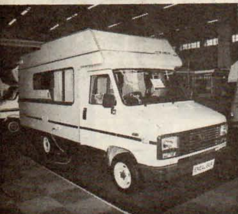
The Excalibur by CI Autohomes on the new Talbot Express.