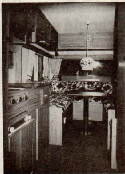
Interior of the luxurious and well equipped Pioneer 1204 on the Mercedes 207D.