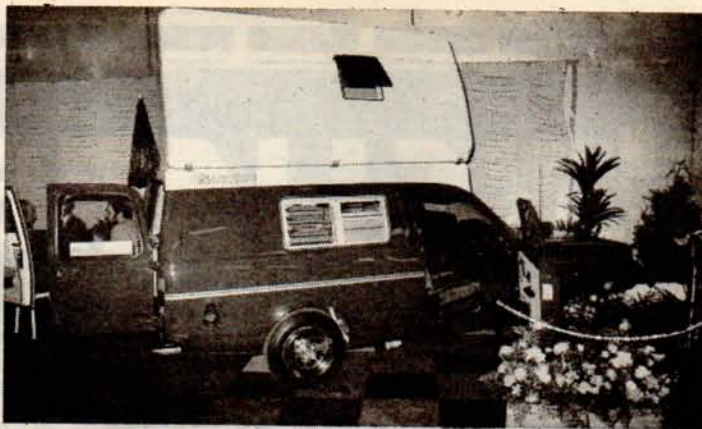
For economy with true car-like driving, the Suntor Marina now built by Brownhills .