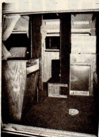
The Holdsworth Hi-Flyer VW hightop motor caravan, the only VW Transporter conversion to offer a toilet compartment.

sworth 'Giant Riser' roof won the panel van class in the 1982 'Motor Caravan of the Year' contest. For 1983 there are improvements including rearrangements in the 'all-round' rear kitchen (itself a leap forward in panel van kitchen layout), fitting of the famous Holdsworth aircraft-style seats, lighter materials for a greater sense of spaciousness, and neat fibreglass window surrounds.