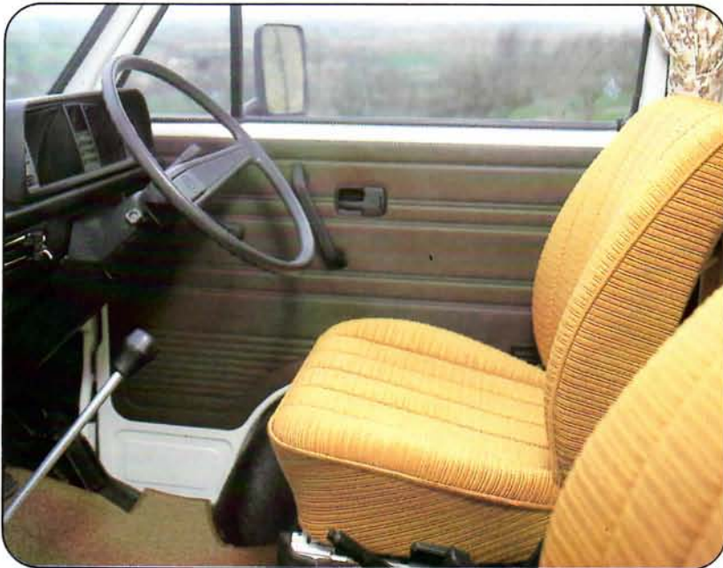
Luxurious seating in a well-designed cab.