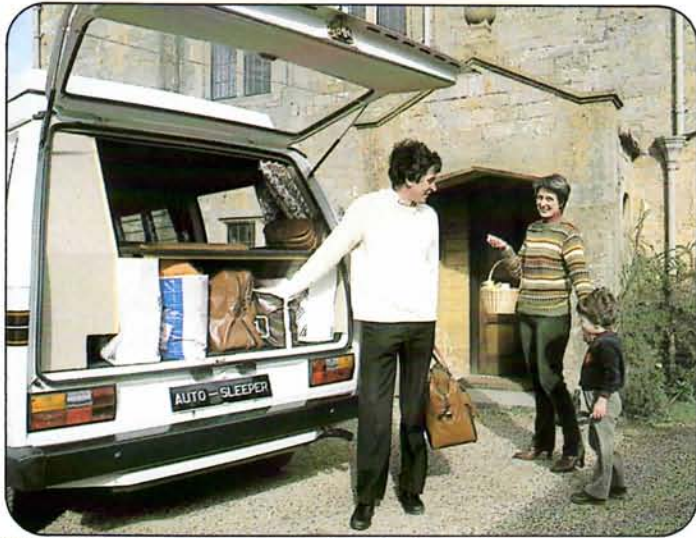
The parcel shelf in position conceals a large boot capacity.