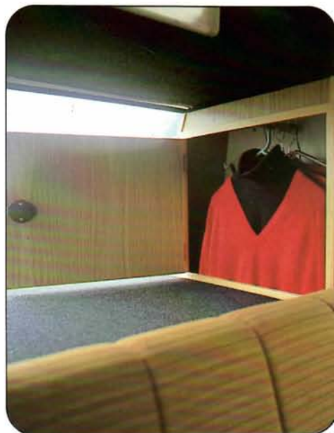
Space for the family clothes in the lined wardrobe.