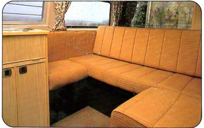
A U-shaped seating arrangement offers ease of access in the dinette.