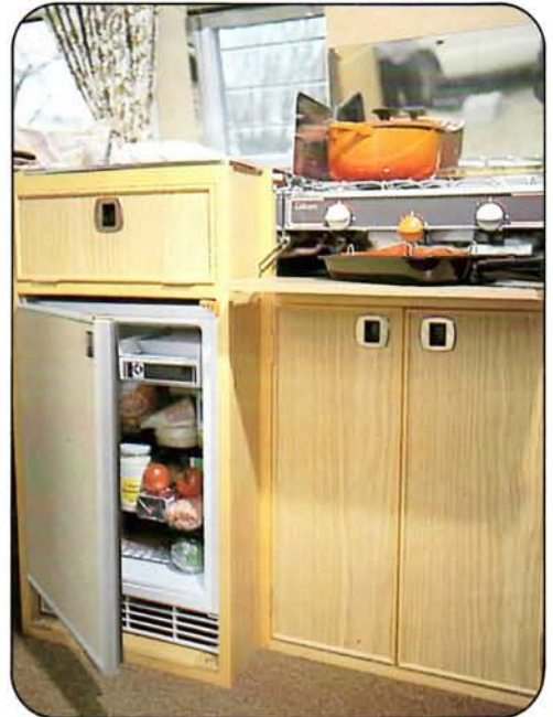
Extensive cupboards complement the kitchen facilities.