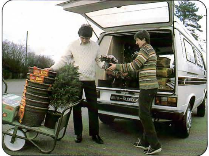
Remove the parcel shelf and the transport of large loads is made simple.