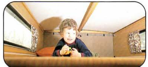
The upper sleeping arrangement, ideal for the youngsters.