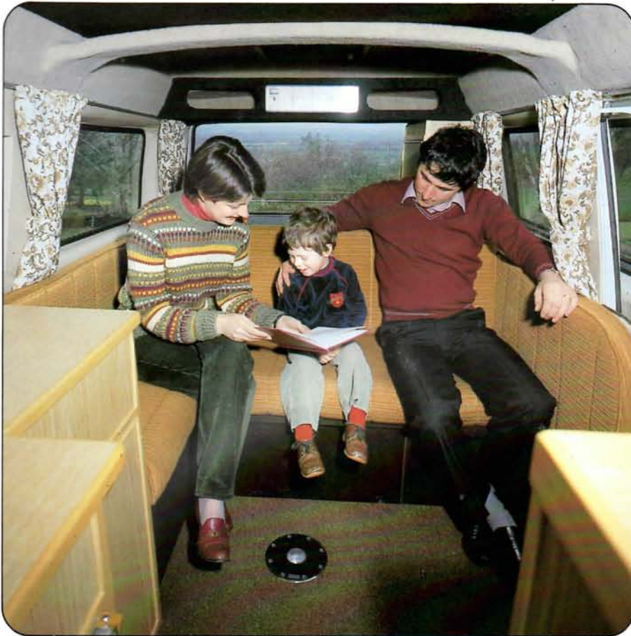
The front-facing bench seat for relaxing or travelling.