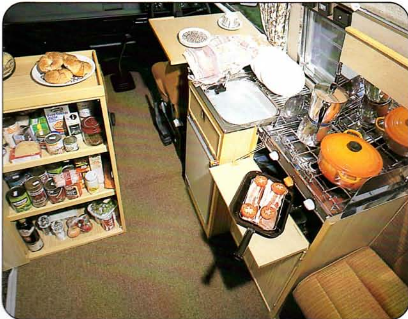
Everything to hand in the most convenient kitchen area.