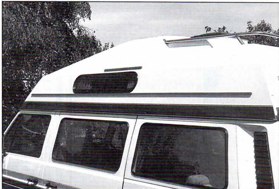
Awning track above window.

Next, we set about finding a suitable area in which to store our plastic tumblers. Just enough space was found to allow