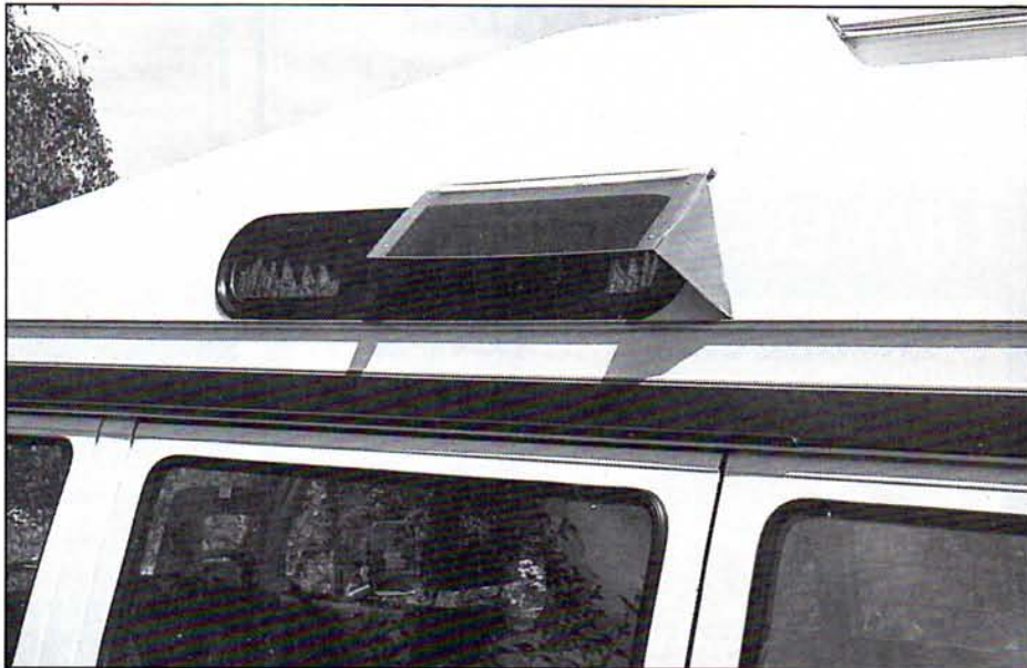
See-through hood repels rain.