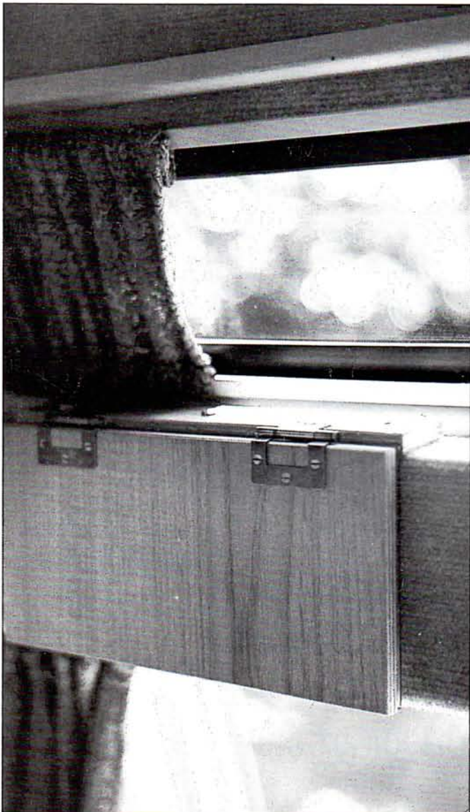
Mirror in travel position.