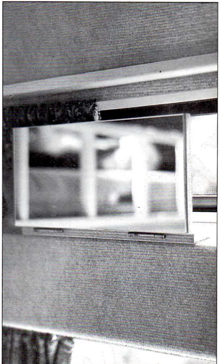
Mirror raised for use.